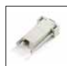
Adapter; RJ45 jack to DB9 pin "D" connector.