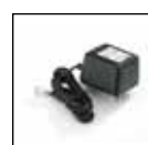
ac adapter with RJ45 plug (powers up to 32 DXD units maximum).