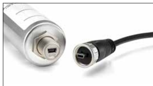
Optional – USB Mini B type