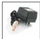
ac adapter with RJ11 plug (powers up to 32 DXD units maximum).