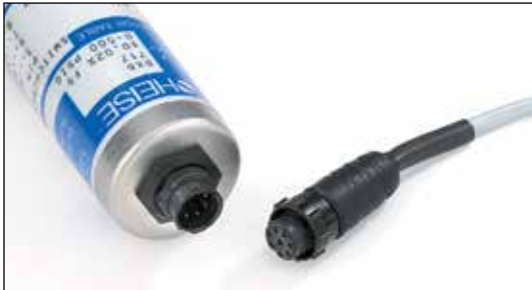
Standard – Switchcraft EN3, 8 pin weather-tight receptacle and mating connector