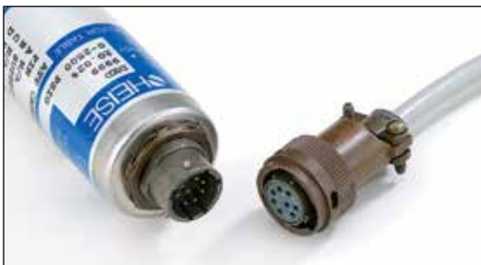
Optional – ITT Cannon kPT07 receptacle with kPT06 mating connector (Bendix PT07/PT06 compatible)