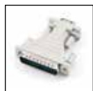
DB25 male to DB9 female plug adapter.