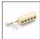
5 port (RJ11) expander module (provides system expansion capability).