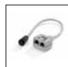
Mating connector/adapter assembly terminating in dual RJ45 (modular "Y") jacks.