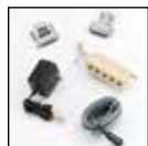
Complete Kit for RS-232 configurations.