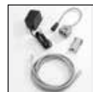
Complete Kit for RS-485 configurations.