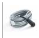
25 ft. cable with mating connector and RJ11 plug. (provided with each DXD; RS-232)

Consult price sheet for complete list of USB, RS-232 and RS-485 accessories and kits.