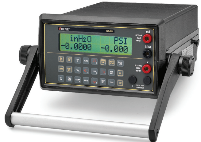
ST-2H Heise Digital Indicator